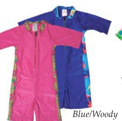
Pink/Leopard Daisy 6SP4522