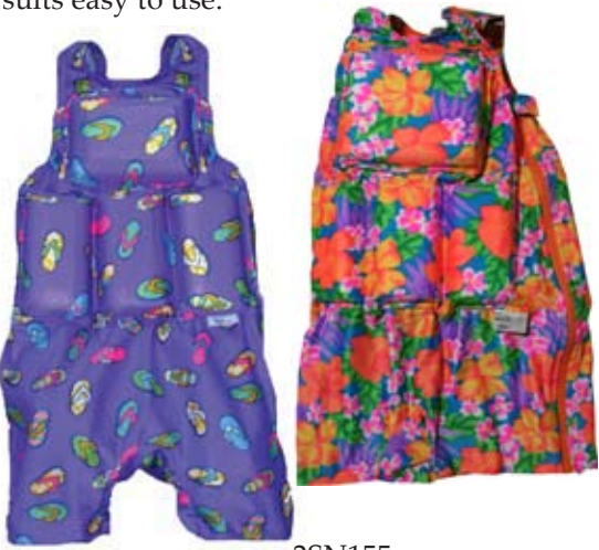
2SN155 Fabrics may vary offered with zelcro or zipper

My Pool Pal® flotation swimsuits have been adapted to accommodate persons with Special Needs. Velcro closures on the side and shoulders make My Pool Pal® Nylon/Spandex flotation suits easy to use.