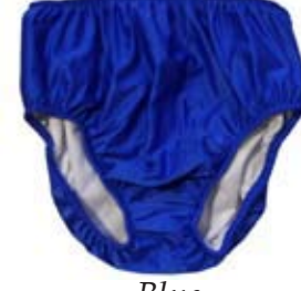
Blue 4AD02 3SD02 and 4HD02