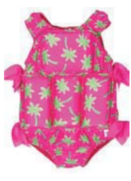
Palm Tree 1BW150