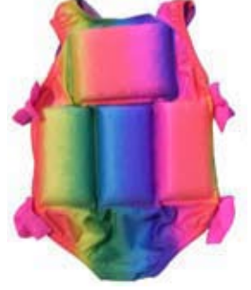
Tie Dyed Rainbow 1BW55