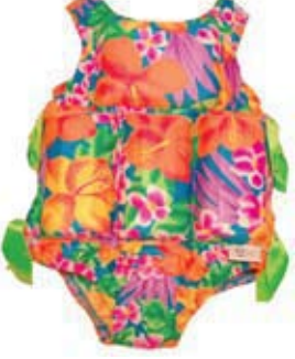
Tropical Garden 1BW4455