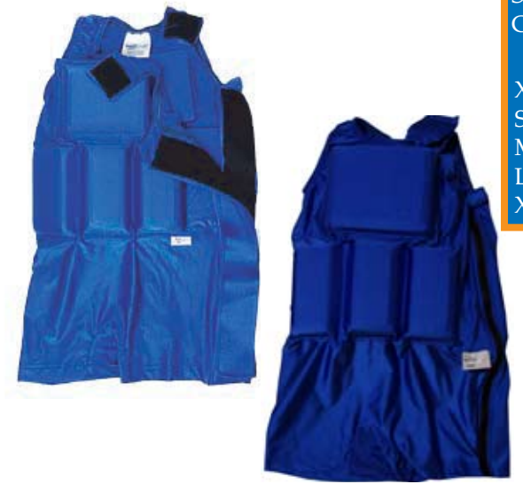
2SN02 Fabrics may vary offered with zelcro or zipper